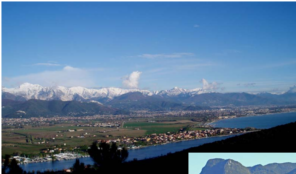
GARFA GNANA ON THE ROAD

Another advantage is our oenological and gastronomic tradition which is the feather in our cap for the curious, tired and, above all, hungry “moto-tourist”.